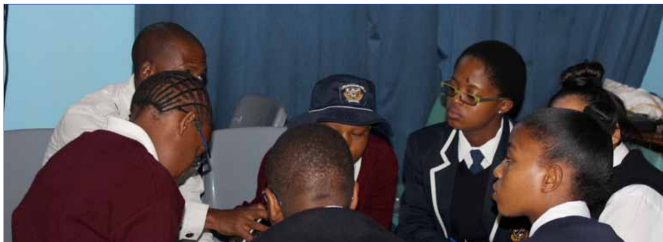
Barutuo ba sekolo sa Butha-Buthe nakong ea lipuisano tsa tlhatlhobo-bocha ea litheko.

Ketso ea ho botsa sechaba e etsoa ke Lekhotla ele ho bula sethala hore lik'hamphani tse fanang ka