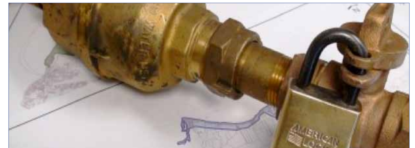
Boemo ba moo phepele ea metsi e khaoloeang.

Khokelo bocha ea ho khaoloe ha tšebeletso ho neng ho sa nepahala, ho lokela o etsoa lihora tse robeli kamora hore ho netefatsoe hore ho bile le ho khaoloe ho joalo □