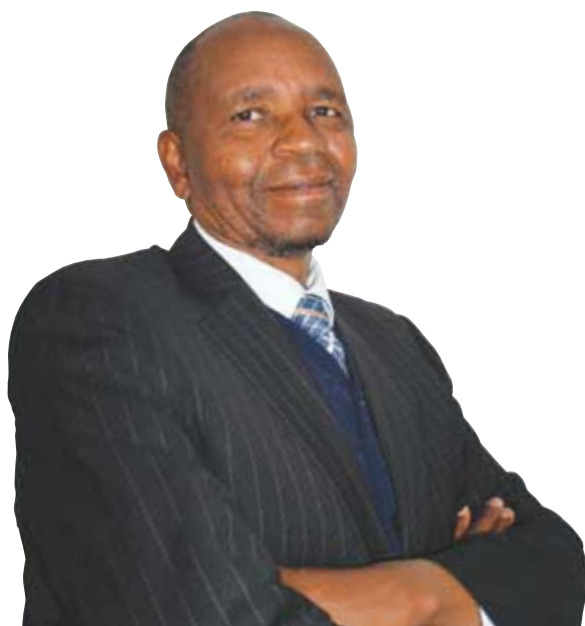
Babali ba ratehang,

R e boetse re le amohela ka mofuthu babali ba leselinyana lena la Lekhotla la Taolo ea Motlakase le Metsi Lesotho (LEWA).