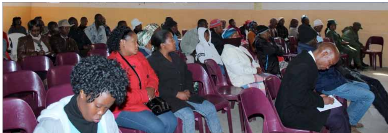
Thuto ho baji ba Mafeteng mabapi le methati ea tharollo ea litletlebo.

Litšebeliso tse bohlokoa tsa likhokahanyo, mohala o fumanehang nako tsohle le tšebeliso ea marang-rang e lokela ho ba teng molemong oa tlaho ea liphoso tsa motlakase le li tšohanyetso. Liperesente tse lebeletsoeng tsa katleho ea tšebetso ea mashome a robong a metso e mehlano lekholong (95%). Ho feta moo, LEC e lokela ho ba le tšebeliso ea mohala (fono-fono) le mokhoa oa marang-rang ba keng sa litletlebo, lipotso le likopo tse etsoang ho bareki ka nako ea tšebetso. Ke bonyane linoko tse mashome a robong le metso e robong lekholong (99%) tse lokeloang ho fihleloa.