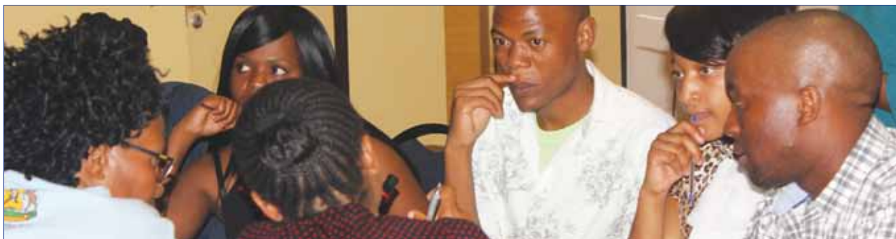
Boithuto bo reretsoeng, hara tse ling, ho matlafatsa phepelo ea motlakase hore e anele sechaba.

Litsi tsa mantlha tsa lefapha la motlakase tse amehang boithutong ke LEWA, K'hamphani ea Lesotho ea Motlakase (LEC) le Lefapha la matla (DoE) □