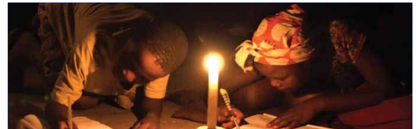
Litla-morao tsa khaolo ea phepelo ea motlakase.

Ho ea ka QOSSS, khaolo ea motlakase ka lebaka la ho se lefe mekoloto e lokela ho etsoa kamora tlhokomeliso ea matsatsi a mabeli ho mosebetsi oa mohoebi kapa bo-ralifeme. Bakeng sa bareki kapa basebelisi bao e seng ba khoebo, tlhokomeliso ea bonyane matsatsi a mahlano e lokeloang ho fanoa pele phepelo ea motlakase e ka khaoloa.