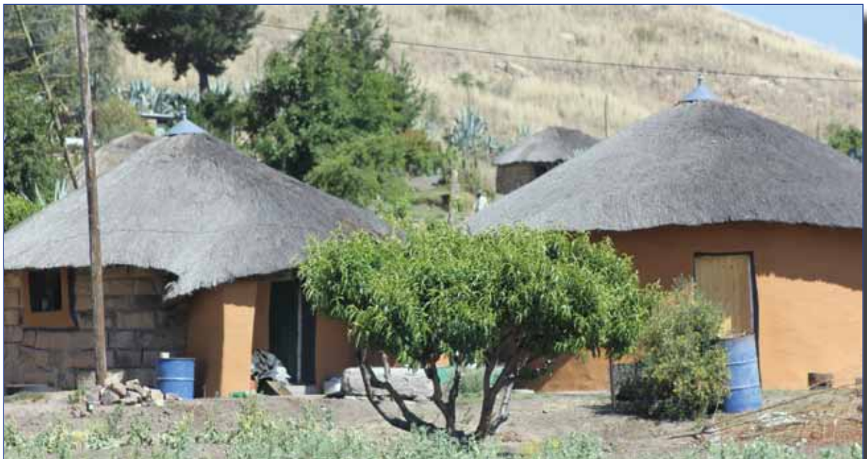
Matlo a kentsoeng motlakase metseng ea mahaeng