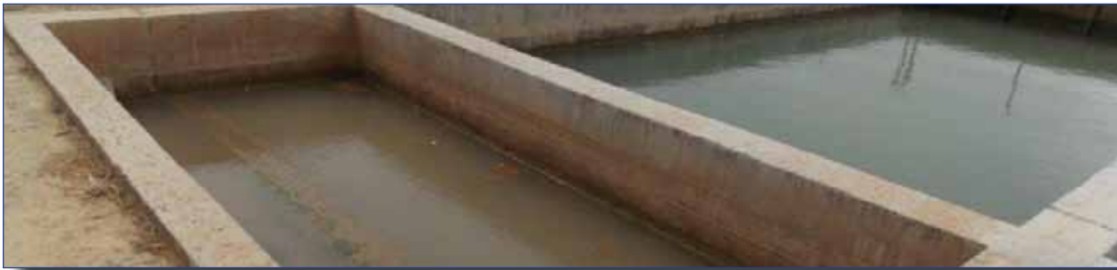
Matamo a tlhoekiso metsi a WASCO Mohale's Hoek