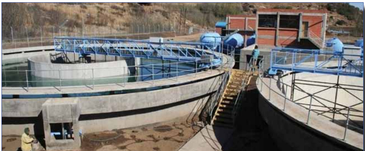
Setsi sa WASCO sa tlhoekiso ea metsi