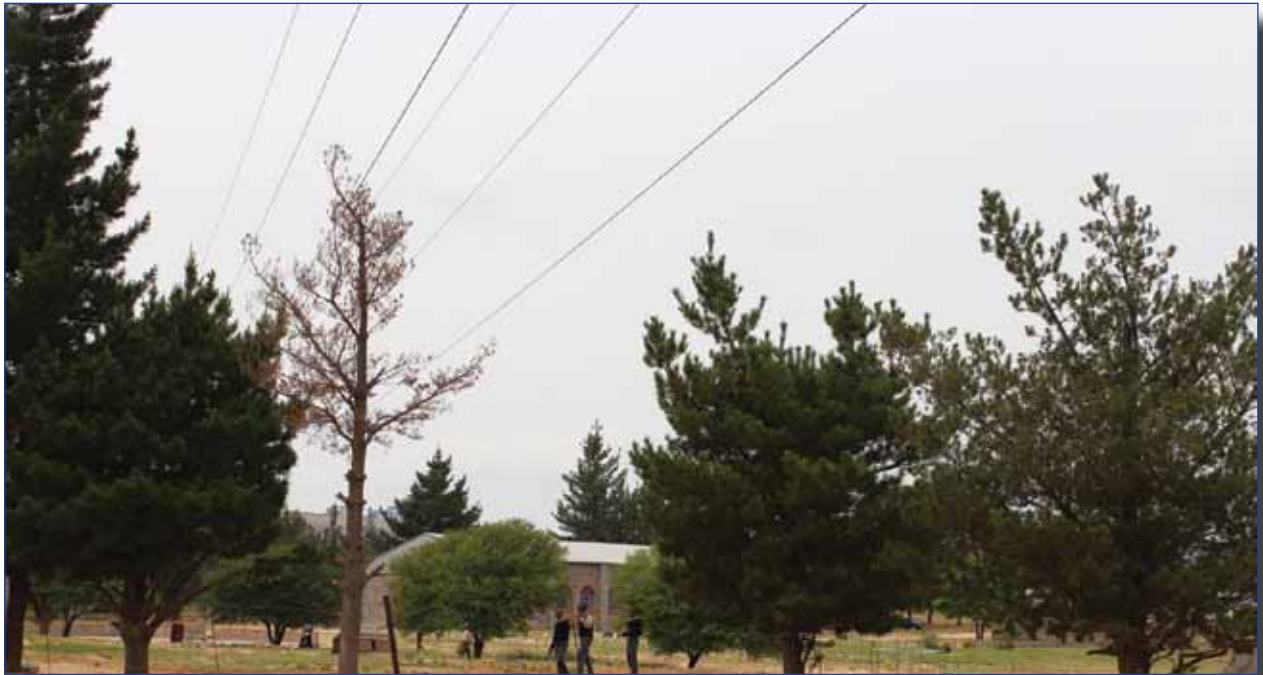
Tse ling tsa litletlebo li bakoa ke marang-rang a motlakase kahar'a metse

lintha tse ka thusanang tharollong ea tletlebo, ebile ho ntse ho hlokometsoe litaba-tabelo tsa mahlakore ka bobeli.