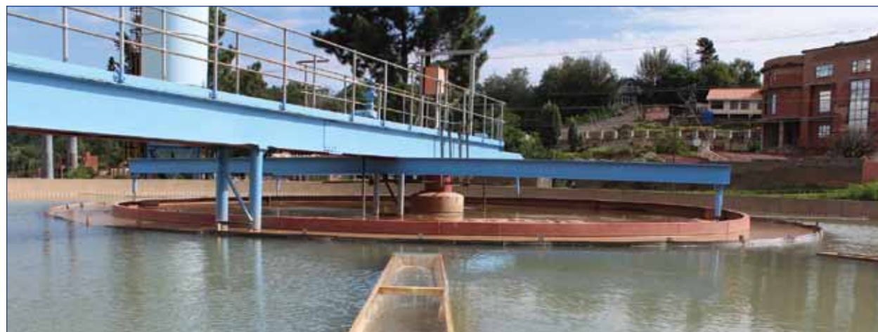
Karolo ea marang-rang a phephelo ea metsi a WASCO Maseru.