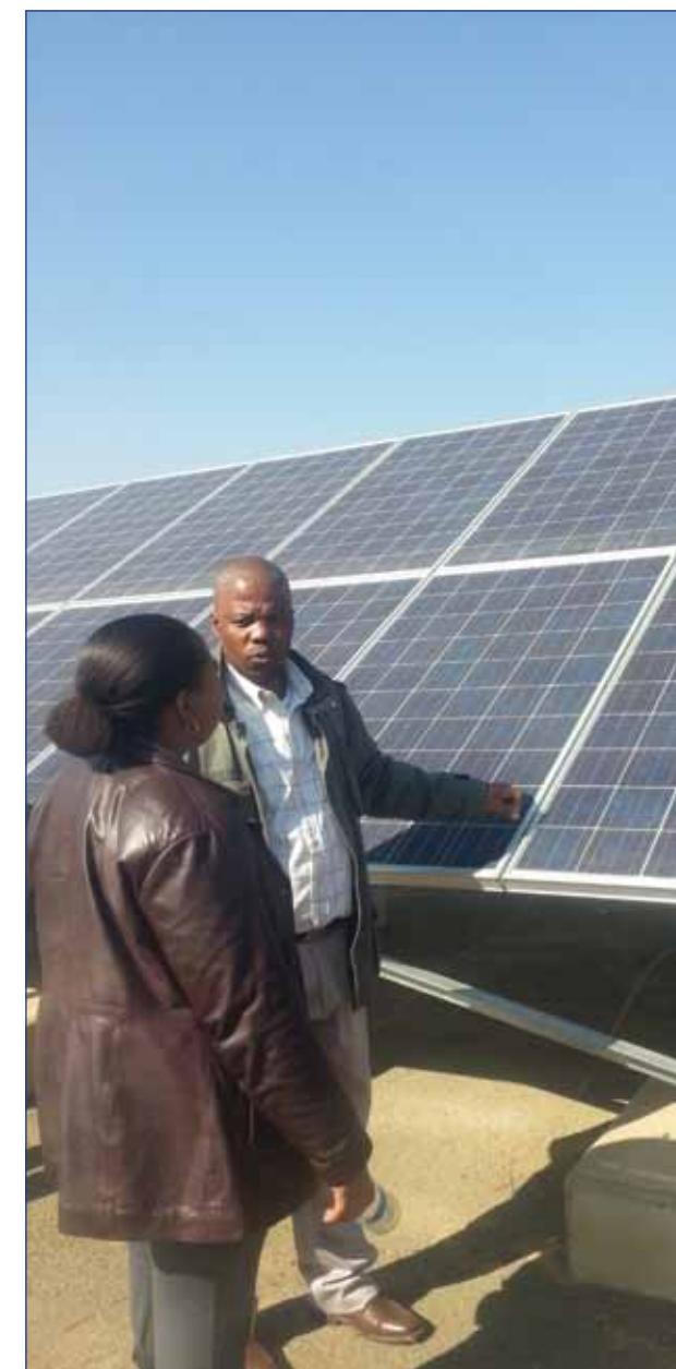
Ba bang ba batho ba neng ba le thupelong ba ile ba chakela setsi sa motlakase oa letsatsi Moshoeshe I, Mazenod.

O boetse a bua haholo ka lithupelo tse ileng tsa tsoaroa