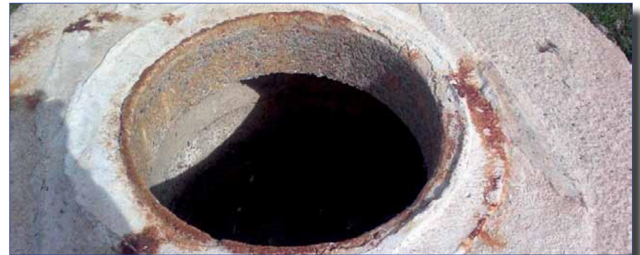
Ho bohlokoa hore batho ba tlahele marang-rang a likhoerekhoere a senang likoahelo ho WASCO kapa LEWA e le hore likotsi li se etsahale.

Tse ling tse ileng tsa tšohloa li kenyeletsa tsamaiso ea litšebeliso tsa bohloeki, tsamaiso ea literopo tse nyane le tse ho ithuta ka tšebetso e ntle litabeng tsa tšebetso ea taolo