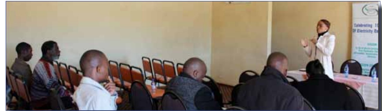
Ba neng ba nkile karolo phuthehong ea Quthing.

A supa hore mehato eohle ea methati e lokeloang ho lateloa e fetisetsoa sechabeng ka mekhoe eohle ea liphatlatso. E le ho netefatsa hore maikutlo a sechaba a ea mameloa, bohle ba bontšitseng ka mongolo hore ba ka phatlalatsa maikutlo a bona ka pele ho Boto ea Lekhotla le bafani ba litšebeliso, ba lumelloa ho etsa joalo. Lekhotla le hlalositse hape hore taba e 'ngoe e