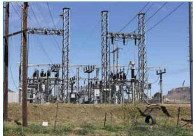
Ho kena tšebetsong ea phepho ea motlakase ho hloka litsebo le chelate.