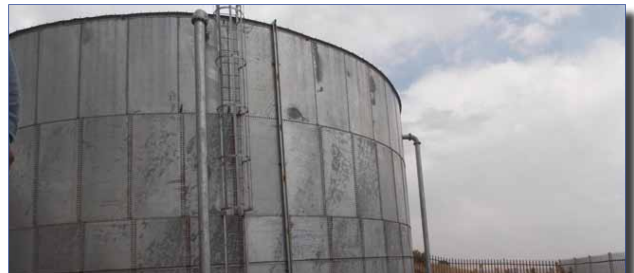
Ke taba ea bohlokoa ho sebelisa metsi ka hloko e le hore a polokelong a se fele kapele.