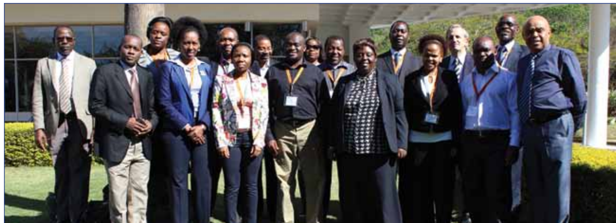
Baemeli ba bileng teng phuthehong ea Litaba tsa Tšireletso ea Basebelisi ba Motlakase le Liphatlalatso.

Litabeng tsa ntšetso-pele ea litsebo/boiphihlelo ba 'Mamekhatlo le Litho tsa ona tse hlalhang kahar'a Moralo oa Tšebetso oa RERA, khohale tso e bile hore litho tsa RERA li fane ka maikutlo holim'a maoala a ka lateloang ho fihlela taba-tabelo eo ea litho tsa Mokhatlo. Ho feta mona ho entsoe khohale tso e hore ho lokisoa mokhoa oo ka ona Balula-litulo ba Liboto tsa Litho tsa RERA ba ka kopanang ho thakelana ka malebela.