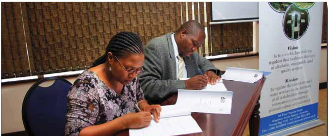
Ba babeli ba Babusi ba Litereke ba tekena Tumellano ea Tšebeliso-moho lipakeng tsa LEWA le liofisi tsa Babusi ba Litereke, setsing sa Lehakoe Recreational.