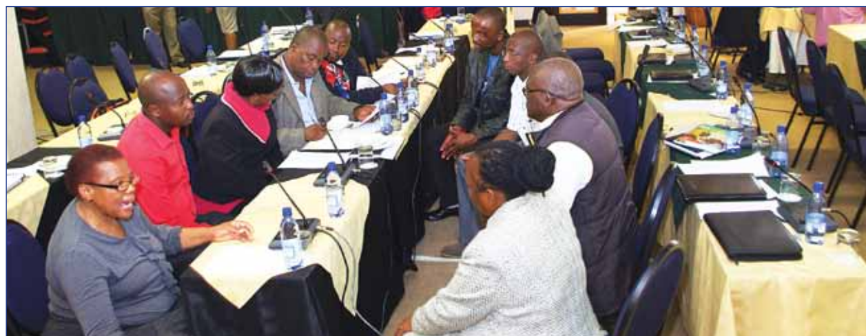
Se seng sa lihlopha tse ileng tsa boptjoa ho tšohla kopo ea WASCO 'mokeng oa ho nonya sechaba o neng o le Maseru.

Sechaba se hlokomele hore bakeng sa mokhahlelo oa Band A lilitara tse 1,000 tsa metsi e se ele M26.11 papisong le lipompong tsa sechaba (standpipes) moo teng e leng ba M5.66.