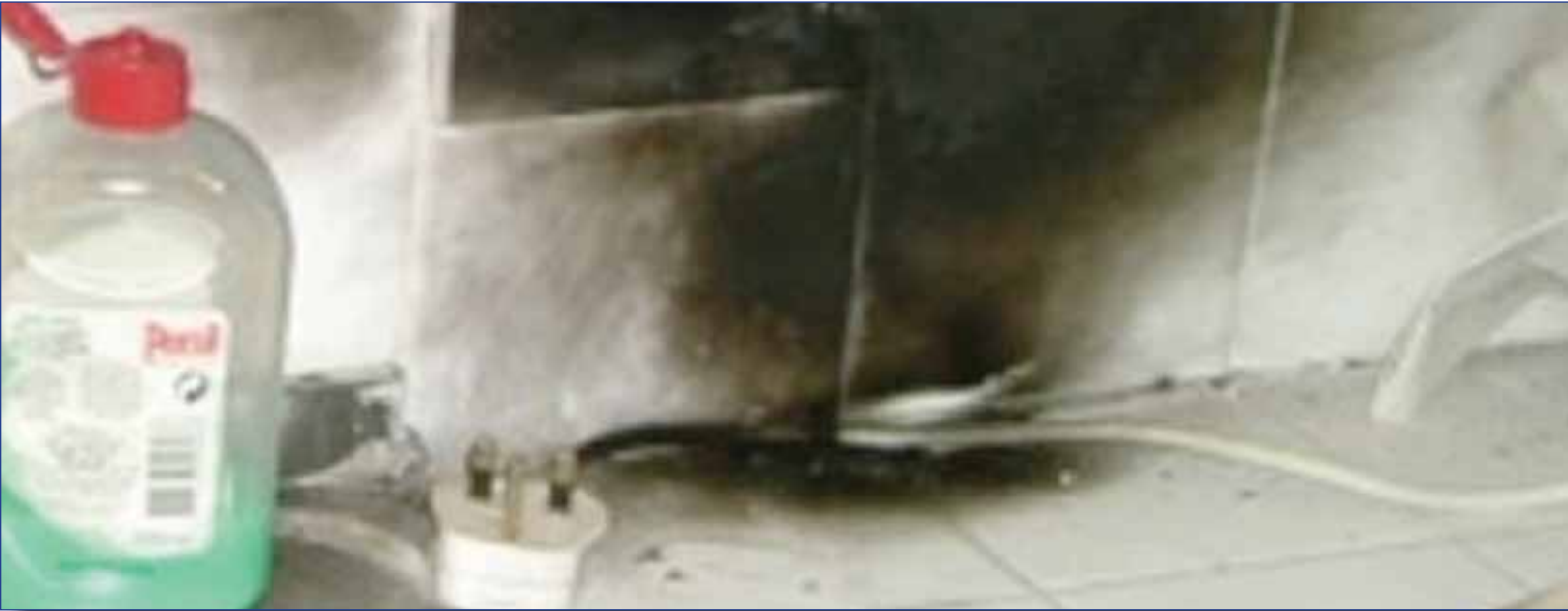
Lehoko le bakiloeng ke ho cha ha thepa ea ntlo ka lebaka la tšebeliso e mpe ea motlakase