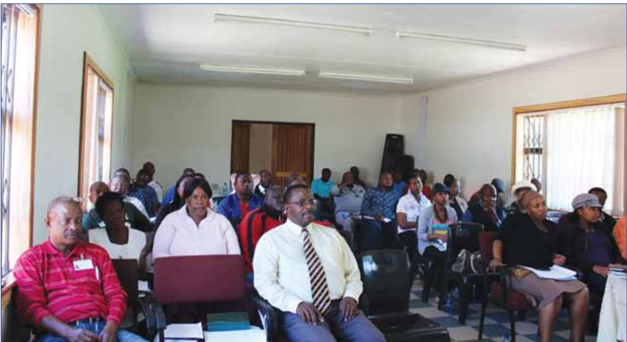
Sechaba sa Mokhotlong phuthehong e neng epiloeng ke Lekhotla.

Sechaba se ile sa hopotsoa ke hona hore, ho latela molao o thehileng Lekhotla, LEWA e lokela ho khothaletsa mosebetsi oa katoloso ea litšebeletso tsa motlakase le metsi moo khoebo kapa mosebetsi o joalo o ka atlehang.