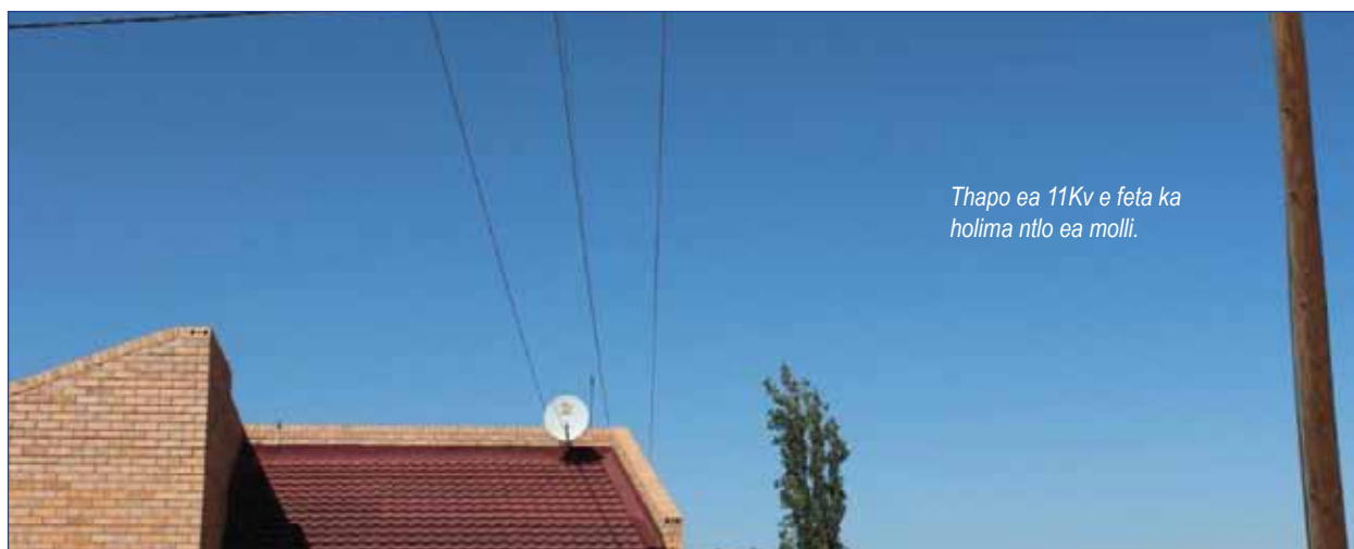
Thapo ea 11Kv e feta ka holima ntlo ea molli.

Lekhotla le etsa lipatlisiso nakong eo le rarollang litletlebo.