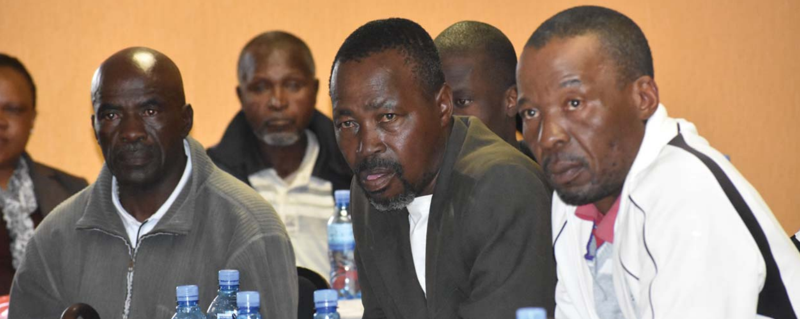
Karolo ea sechaba 'mokenng oa K'hamphani ea Motlakase Lesotho (LEC) ea ho nonya sechaba maikutlo ka Kopo ea nyollo ea litheko le litefiso