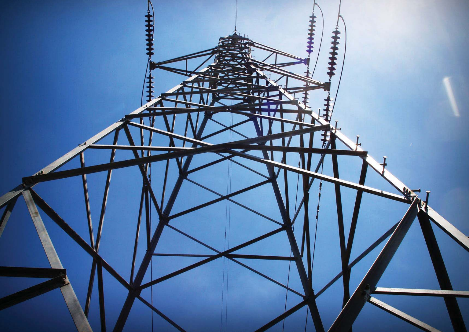
Lipalo tse tsamaisang motlakase.