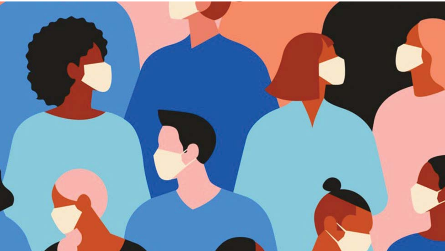
Ho roala semonkoana ho molemo khahlanong le seoa sa COVID-19