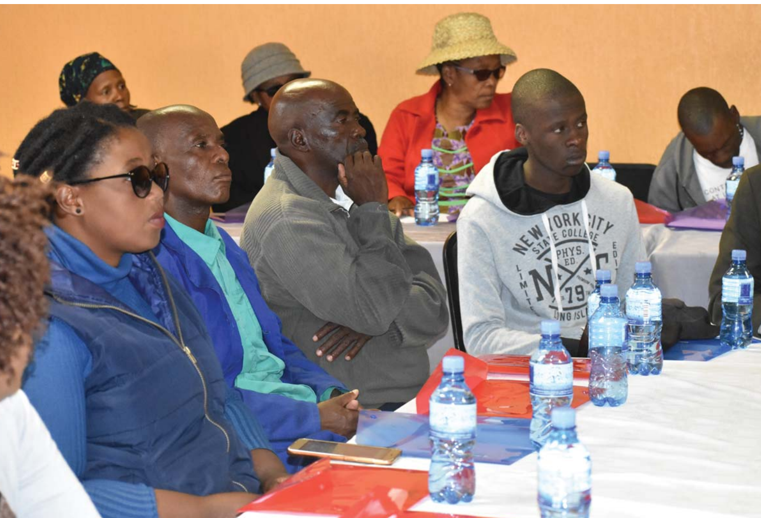
Karolo ea sechaba 'mokeng oa K'hampani ea Motlakase (LEC) oa Kopo ea nyollo ea litheko le litefiso.

Khahlametso ea litefiso malapeng ke mofuta oa theolelo bakeng sa theko ea motlakase o ka tlaase ho 30kWh ka khoeli ka tefiso ea M0.7273 Lisente/kWh . Mofuta oa bobeli oa tefiso ke to tloaelehileng bakeng sa batho ba sebelisang motlakase o ka holimo ho 30kWh ka khoeli ka tefiso ea M1.4782 Lisente/kWh . Lipalo tsohle tafoleng ha li ea kenyetsetsa Lekhetso.